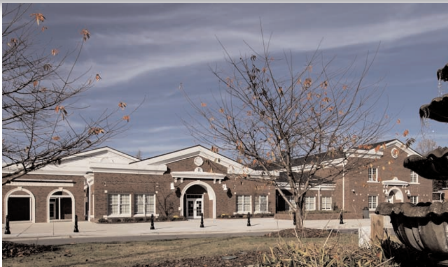
Rockingham Junior High School